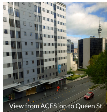
View from ACES on to Queen St.